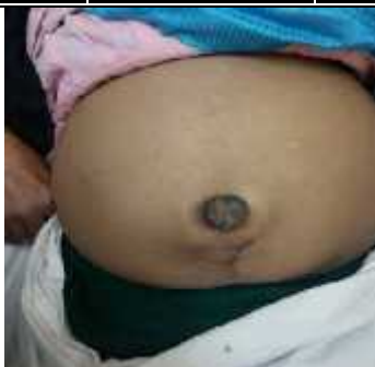
Fig (2): female patient 60 years with umbilical mass (Sister Josef nodules)