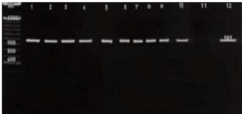
Fig. 1: Typical amplicons of the clumping factor ( clfA ) gene of some S. aureus strains. Lane M: 100-bp-molecular-size DNA ladder, Lane 1 – 3: strains of S. aureus detected from cow's raw milk, Lane 4 – 6: strains of S. aureus detected from buffalo's raw milk, Lane 7 - 8: strain of S. aureus detected from sheep raw milk, Lane 9 - 10: strain of S. aureus detected from goat raw milk, Lane 11: Negative control "unamplified PCR product" and Lane 12: Positive control "amplification of the 985 bp fragment of S. aureus from the extracted DNA of S. aureus reference strain".